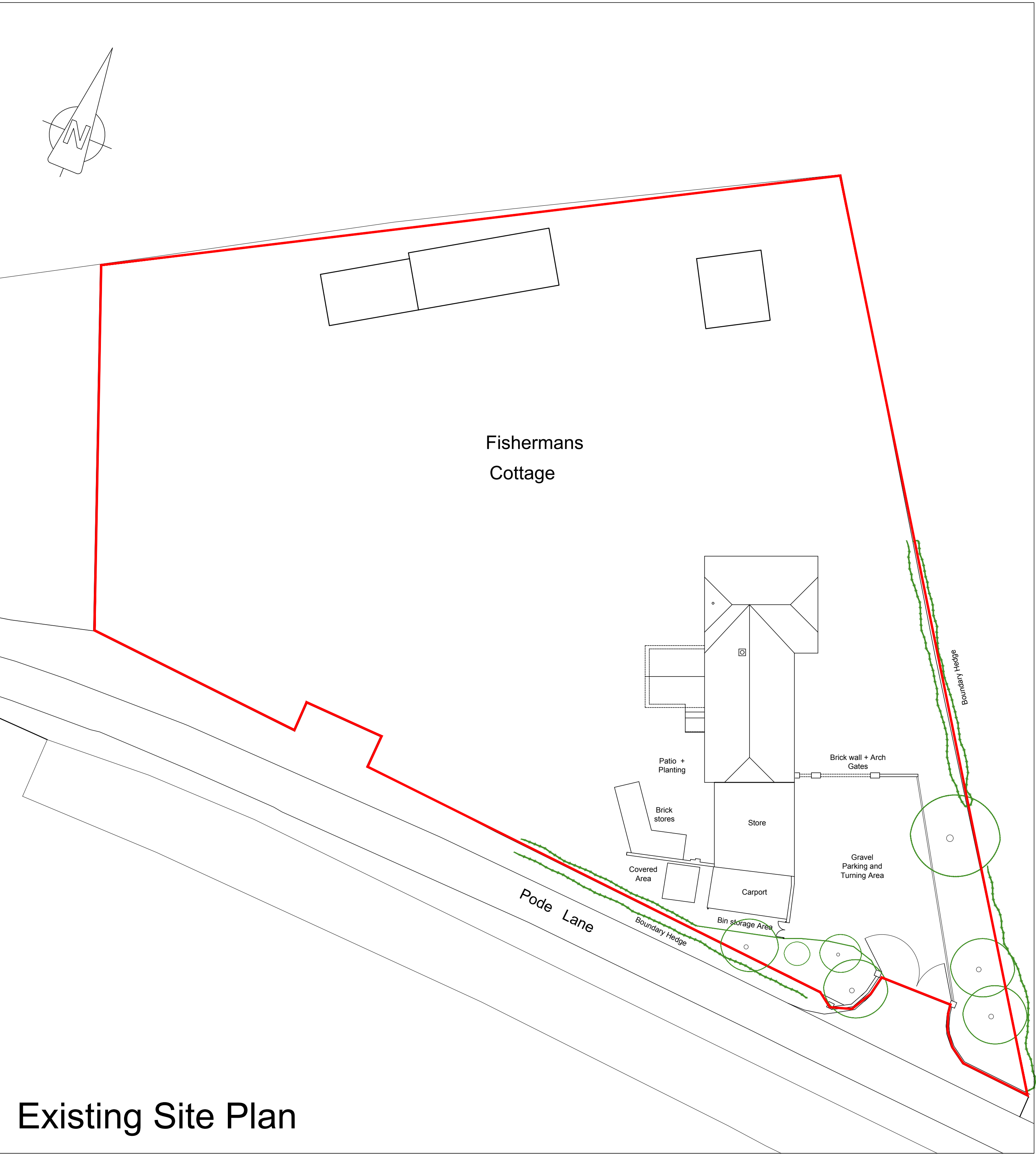
Existing Site Plan